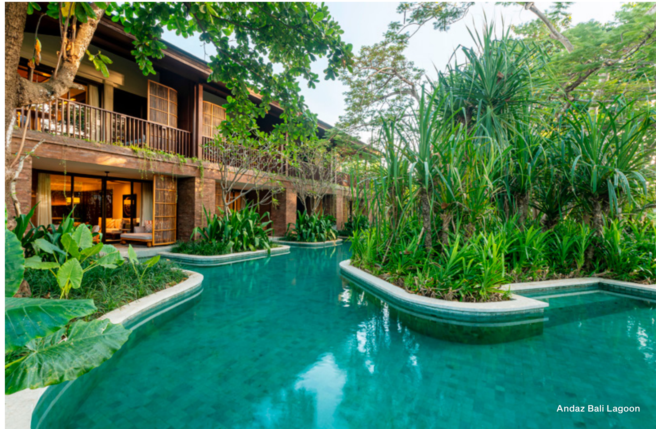
Andaz Bali Lagoon