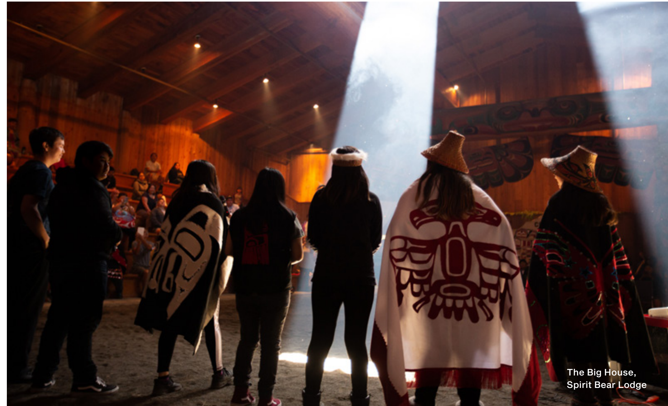
The Big House, Spirit Bear Lodge