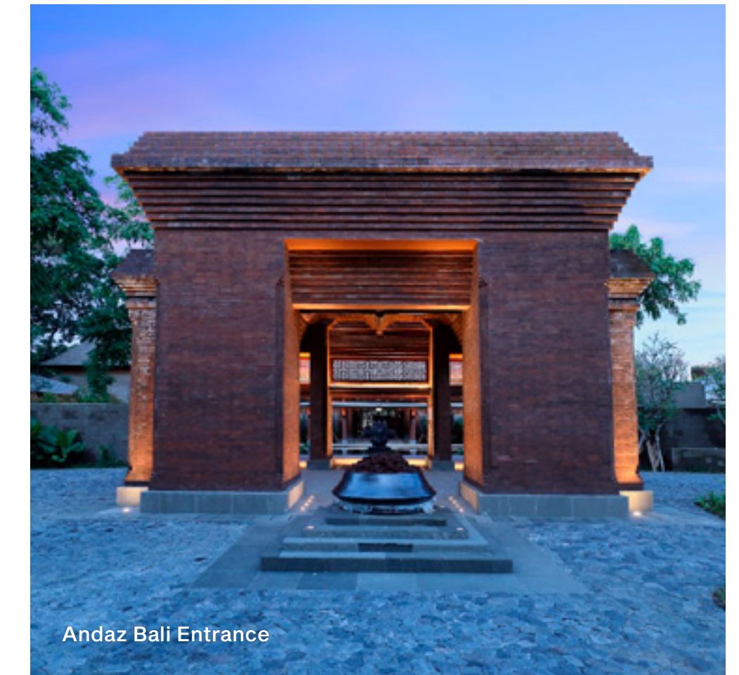
Andaz Bali Entrance